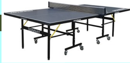
Table tennis on new tables in the hub